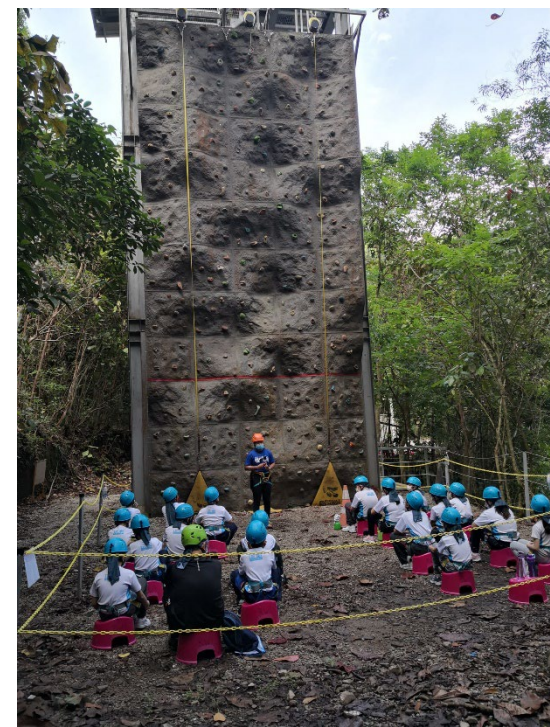
P5 Outdoor Adventure Camp