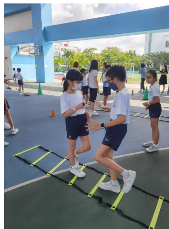
Holistic Health Festival